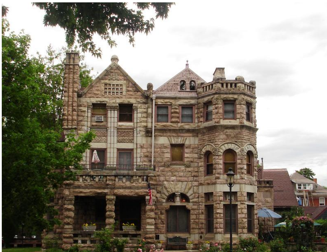
The Castle Marne